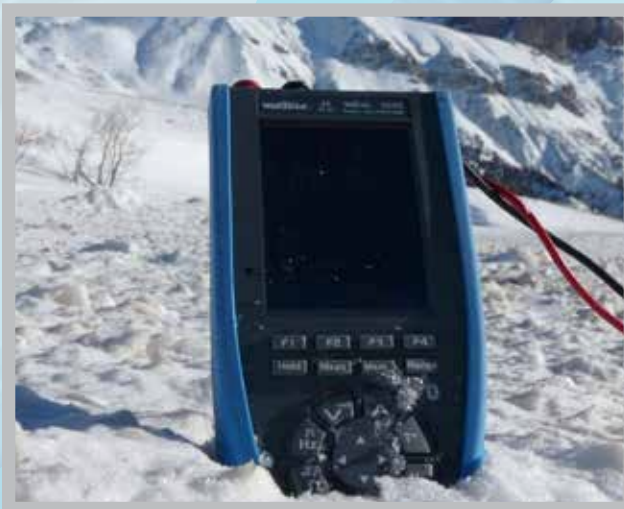
The IP67 protection of the ASYC IV models means they can handle applications in difficult environments