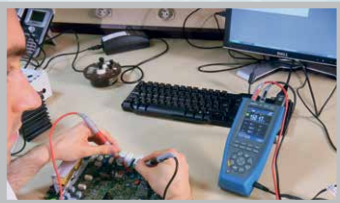
... or After-Sales Service