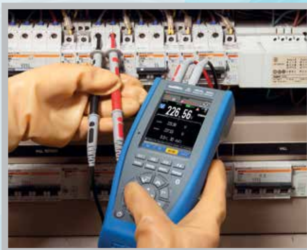
Measurements on electrical cabinets